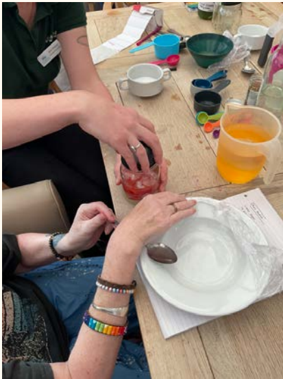
A Pickling Workshop making some Asia inspired pickles!

This newsletter is just a small peek into everything we do at the Vicarage. We've had our regular baking/food sessions all month following our theme of the week of course! some really wonderful art sessions, lots of pampering with massage & nail care and our classic games sessions with Bingo and regular quizzes.