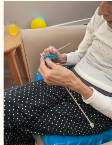
Reskilling our resident knitters with our knit and natter sessions!

As always if you'd like to get involved in any of our activities or plan something special you know your loved one would enjoy please get in touch.