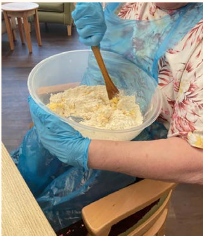
Having a go at making some war time inspired scones for our reminiscence week.

As always if you'd like to get involved in any of our activities or plan something special you know your loved one would enjoy please get in touch.