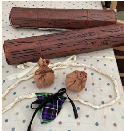
Our Cabers, Mini Haggis and Tug'o'war ready for the mini highland games!