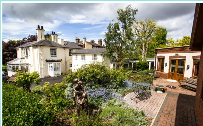
ORIEL CARE HOME 87, Hagley Road, Oldswinford, Stourbridge DY8 1QY T: 01384 375867 F: 01384 443597 E: oriel.care@btconnect.com www.orielcare.co.uk