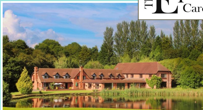
CADMORE LODGE St. Michaels, Tenbury Wells, Worcestershire WR15 8TQ T: 01584 810044 E: info@cadmorelodge.co.uk www.cadmorelodge.co.uk