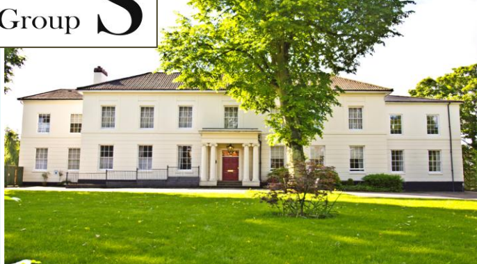
THE SHRUBBERY NURSING HOME, Birmingham road, Kidderminster, Worcester DY10 2JZ T: 01562 822787 F: 01562 68122 E: info@shrubberynursing.co.uk www.shrubberynursing.co.uk