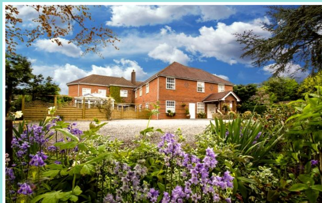
ALLENBROOK NURSING HOME 209, Spies Lane, Halesowen, West Midlands B62 9SJ T: 0121 422 5844 F: 0121 423 4584 E: allenbrook@btconnect.com www.allenbrooknursinghome.co.uk